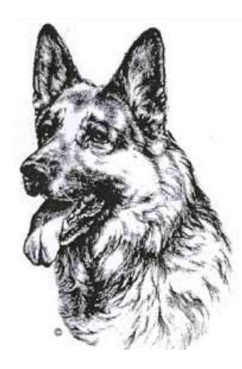
Pride on Parade

Lincolnwood Training Club's 82<sup>nd</sup> annual Obedience Trial for German Shepherd Dogs celebrates eight decades of holding specialty obedience trials for German Shepherds in the Chicagoland area. Lincolnwood is one of the nation's first obedience clubs devoted to this wonderful breed.